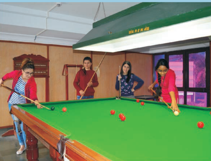
CSSTEAP Students playing Snooker