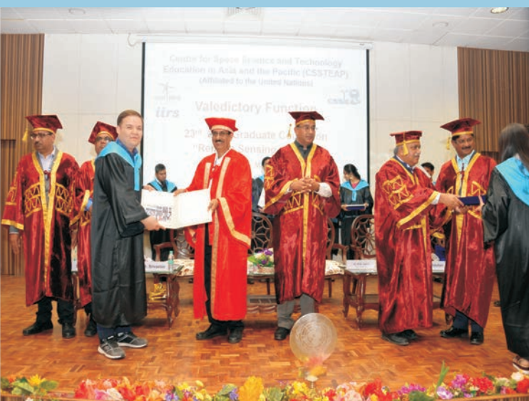
23 rd RS&GIS Course participant receiving certificates during valedictory function at IIRS, Dehradun