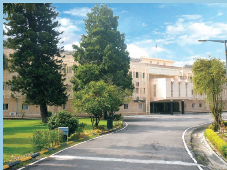
Indian Institute of Remote Sensing (IIRS) Campus, Dehradun