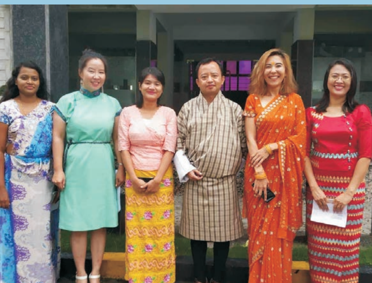
24 th RS&GIS Participants in their national dresses