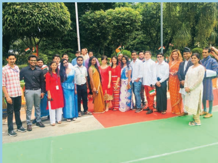
24 th RS and GIS Participants Participating in Independence Day Celebrations at IIRS

(ii) Master programme: This programme gives an opportunity and continuity in developing higher research skills for those who have completed successfully the nine months P.G. Course. This is subject to qualifying for admission requirements of Andhra University, India. A research project by the scholars is conducted and executed in their