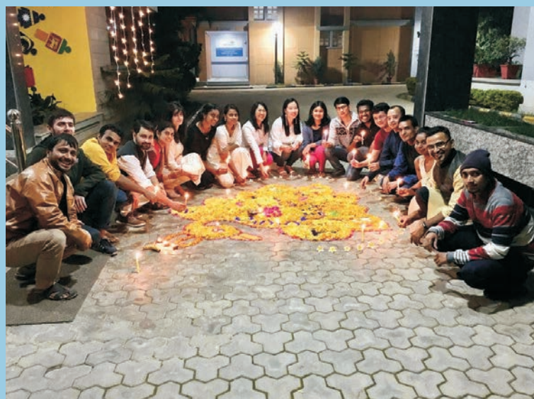
24 th RS&GIS Participants Celebrating Diwali (Festival of Lights) at IIRS, Dehradun

Phase-I of RS and GIS Course is divided into two Semesters. Semester-I is of 4 months duration and consists of module-I covering RS, image interpretations and analysis, Photogrammetry, GPS, GIS and environmental assessment & monitoring. Semester-II is of 5 months duration and consists of two modules, module-II of 2 months focuses on application of RS and GIS in thematic disciplines namely, Agriculture and Soil; Forest Ecosystem Assessment & Management; Geosciences & Geohazards; Marine & Atmospheric Science; Water Resources; Urban & Regional Studies; Satellite Image Analysis & Photogrammetry and Geoinformatics. In module-III of 3 months duration each scholar has to formulate and execute a Pilot Project under the guidance of the faculty. These three modules are described briefly ahead.