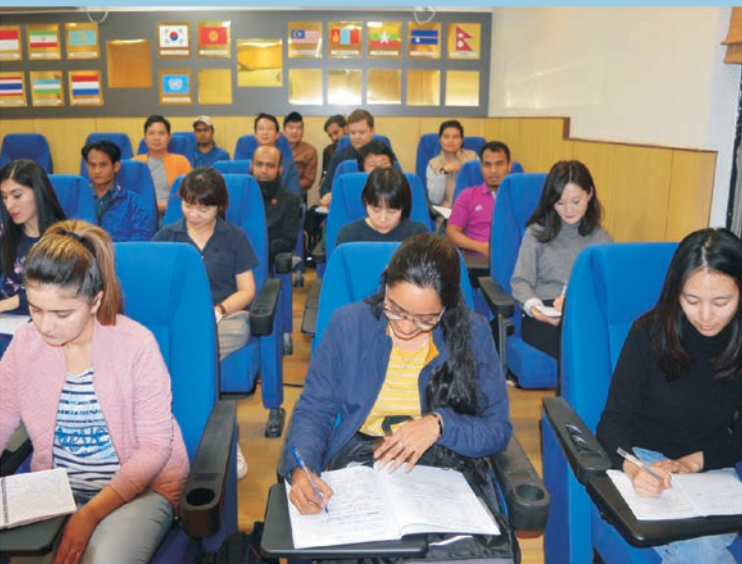
CSSTEAP RS&amp;GIS Participants Attending Classes