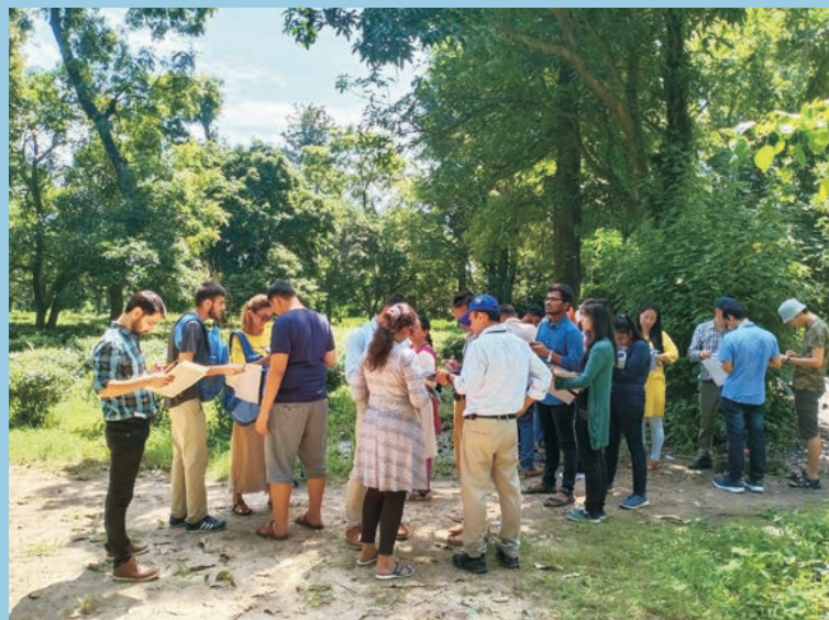
24 th RS&GIS Participants during Field work to Paonta Sahib

Modern facilities exist at the Centre for class-room teaching and practical instructions/demonstrations. Printed as well as digital course material of the lectures is supplied. The teaching methods include class room lectures, video lectures, computer based training packages, laboratory experiments, group discussions, demonstrations, seminar presentations and field work/case studies (as applicable). Computer-based interactive multimedia packages are also available for self learning/ revision. The laboratories are equipped with latest Image processing and GIS software. Each participant is given individual computer system. One of the majors strengths of the institute is its library with latest subject literature, text books, e-books, online-journals, etc.