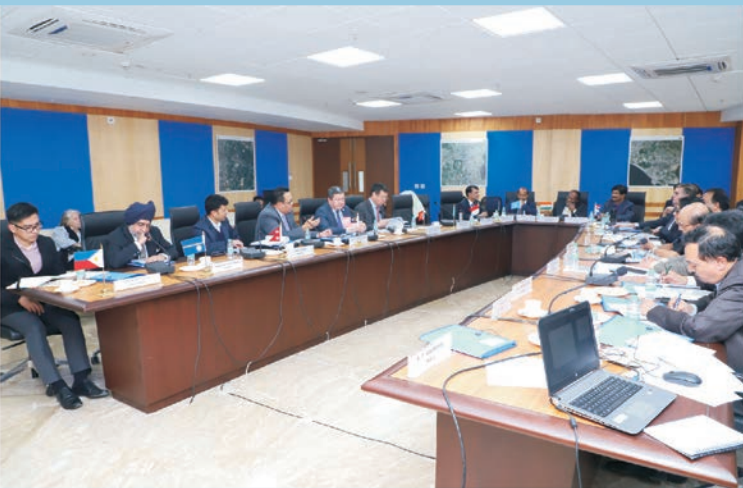
Governing Board Members during 23 rd GB Meeting chaired by Dr. K. Sivan, Chairman CSSTEAP GB