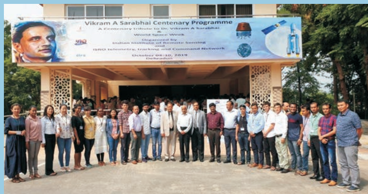
24 th RS and GIS Participants Participating in World Space Week Program at IIRS