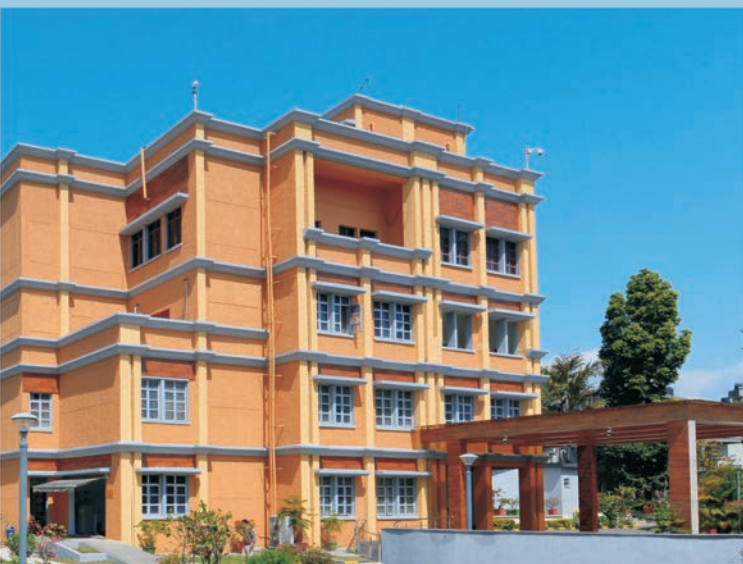
CSSTEAP Headquarters at Dehradun