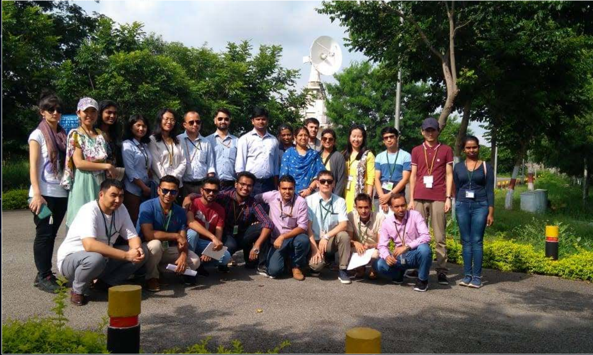
24 th RS and GIS Participants during Technical Visit to NRSC, Hyderabad