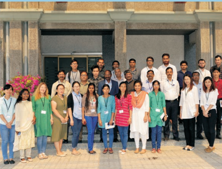
CSSTEAP Participants with Chariman, ISRO