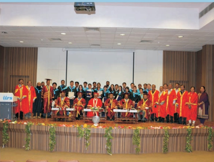
23 rd RS&GIS Course participants with dignitaries during the valedictory function conducted at IIRS, Dehradun

Local tours : INR 50,000 (as per actuals)