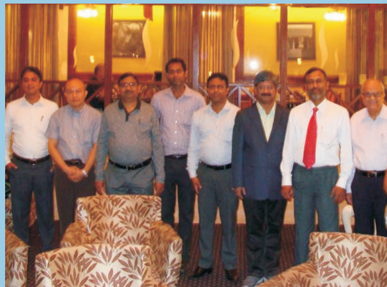
Alumini Meet at Colombo, Sri Lanka