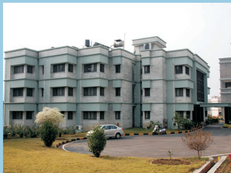
International hostel for course participants at IIRS Dehradun

To download application form or to know more about CSSTEAP, its past and future programmes, list of participants and countries who have benefitted from these and the Pilot Projects carried out through these programmes, please visit us at www.cssteap.org