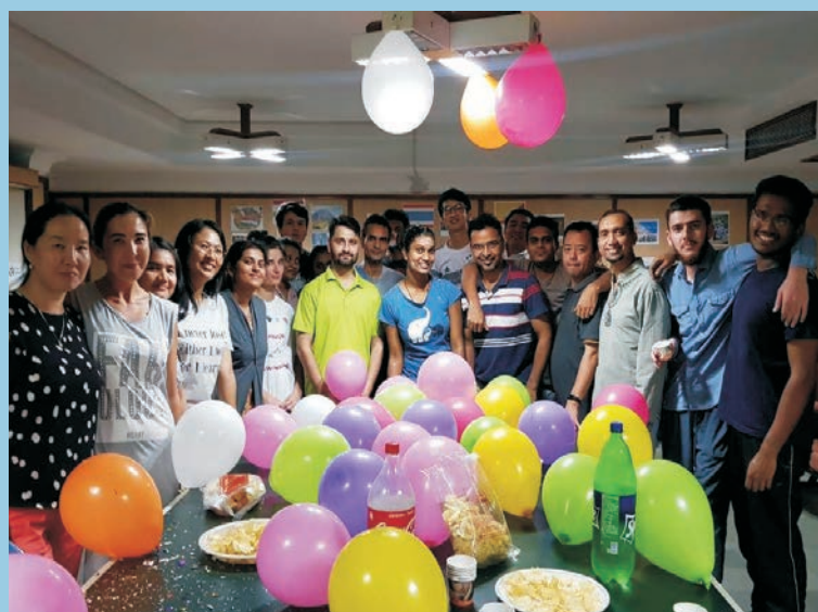
24 th RS&GIS Participants Celebrating Birthday Party at CSSTEAP International Hostel