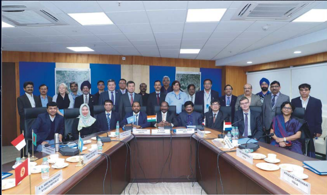
Governing Board Members and Special Invitees during 23 rd Governing Board Meeting at New Delhi, December 10, 2018