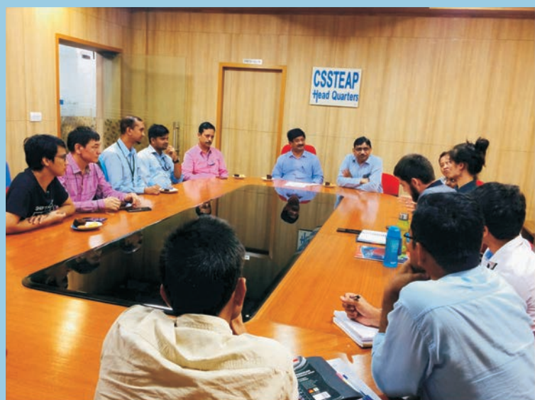
24 th RS&GIS Participants having interaction with CSSTEAP Director