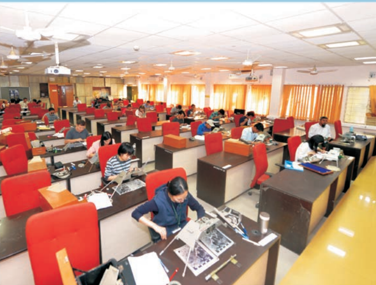
CSSTEAP RS&amp;GIS Participants Attending Practical Classes