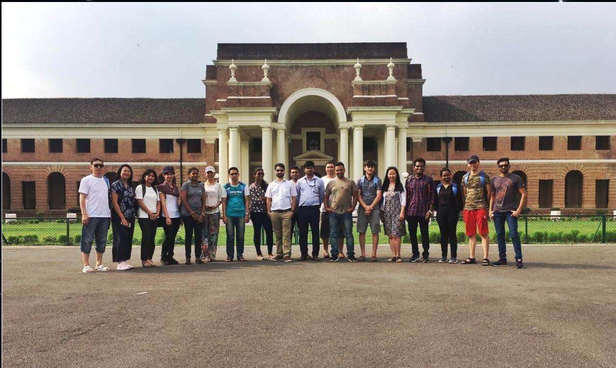
24 th RS and GIS Participants during Visit to FRI, Dehradun